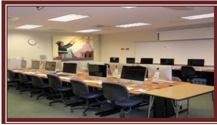
Literacy Center with new dual-boot iMacs